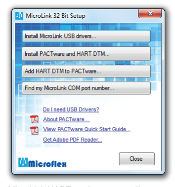
MicroLink HART modem setup utility.

To pre-install the drivers, run Msetup.exe from the included CD and follow the on-screen prompts. The CD will auto-run this file if the Windows autorun feature is enabled for your CD drive. The Msetup.exe is a utility that will determine your operating system and run the correct installer. Click the Install MicroLink USB drivers... button to pre-install the drivers. The driver installer will guide you through the setup process.